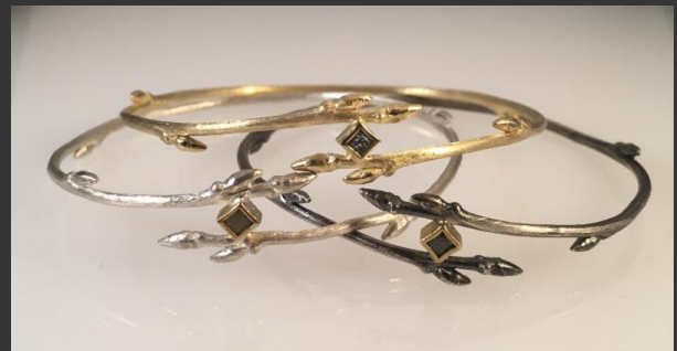
Chapin Dimon "Twin Bangles" - Sterling Silver, 18k Yellow Gold, Natural Uncut Diamond Cubes Cdimond.com