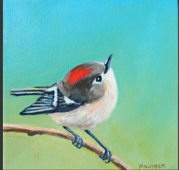
Maureen Riesco "Kinglet" - Oil