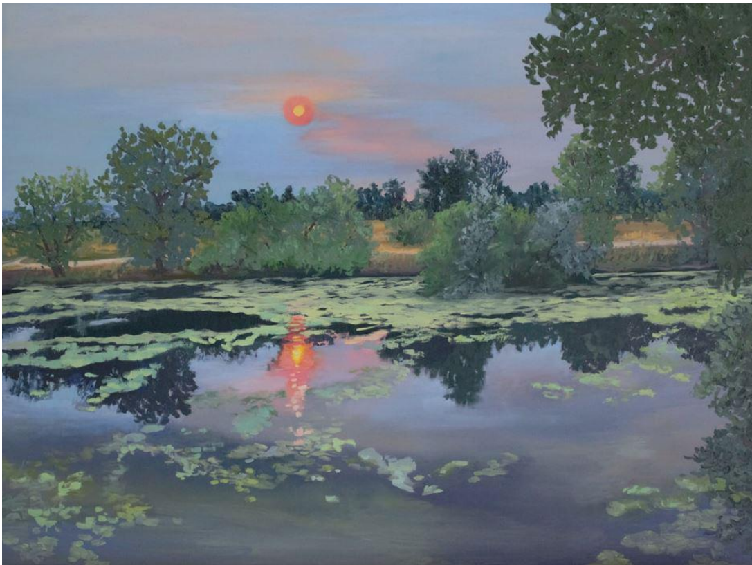
Best in Show: Smoky Afternoon at Warembourg Pond by Lynn Berggren

Artistic Achievement: Edge of Winter by Jody Faught