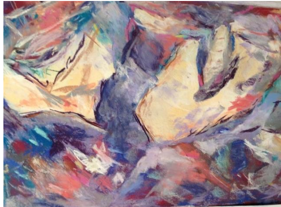
Janek - Soft Pastel