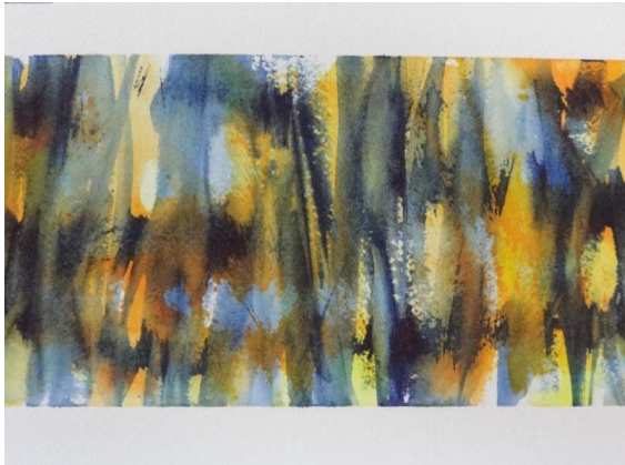
Equinox - Watercolor