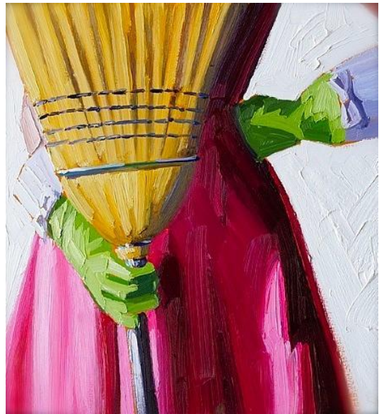
Working Woman- Oil