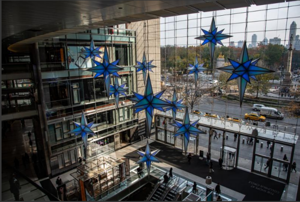
Andy Schwartz "Time Warner Center, NY" - Photography www.soaringlightimages.com