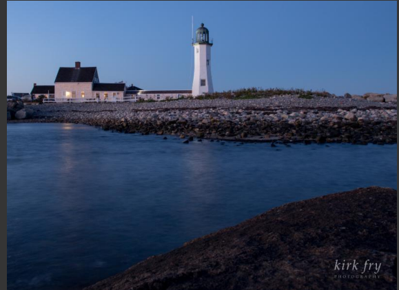
Kirk Fry "Scituate Lighthouse" - Photography kirkfryphotography.com