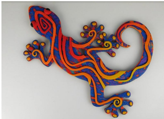
Crazy Stripe Gecko - Polymer Clay Ann Kruglak