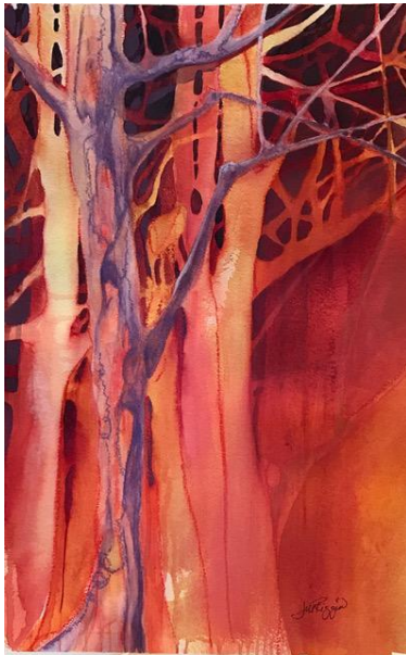
Stay Focused - Mixed Media Jill Rigglin