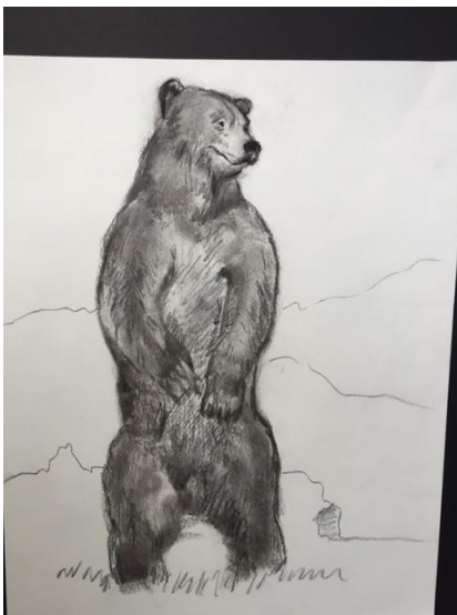
Brown Bear - Pencil Drawing