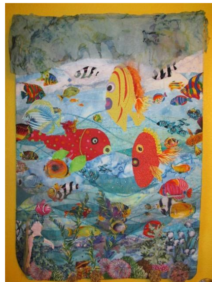
Here Fishy, Fishy - Fiber Art