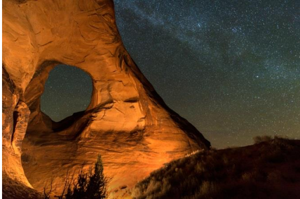
Ear of the Wind - Photography