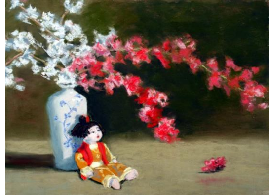
Oops a Flower Fell - Pastel