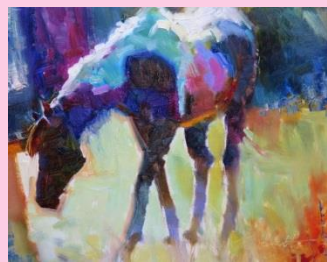
Aimee Deneweth Daily Painting

She will demo one of her daily painting techniques-- Getting glowing colors with transparent pigments (oils). Website: Scarlet Owl Studio