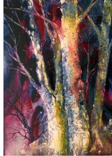
Untitled - Watercolor poured over a Gesso Textured Base