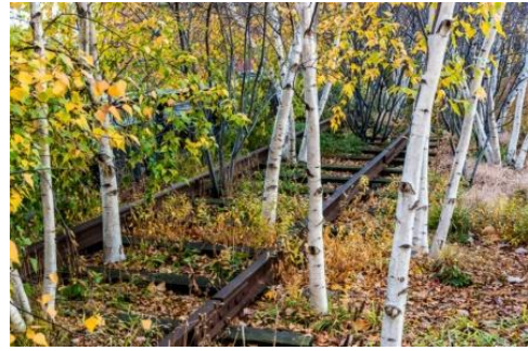
Rail Line of Trees