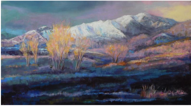
Looking Back - Pastel Lydia Pottoff www.lydiapottoffineart.com