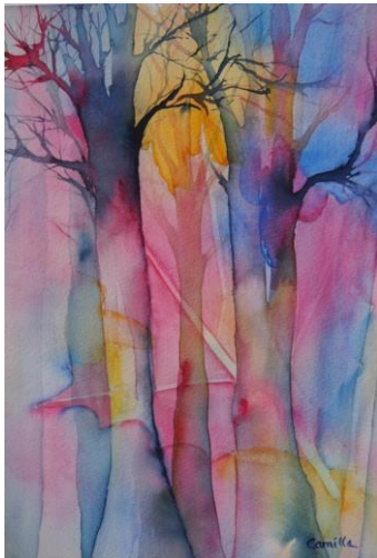
Electric Forest - Watercolor Camilla Pratt www.camillapratt.com